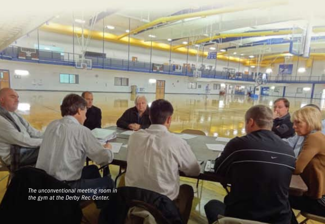
The unconventional meeting room in the gym at the Derby Rec Center.